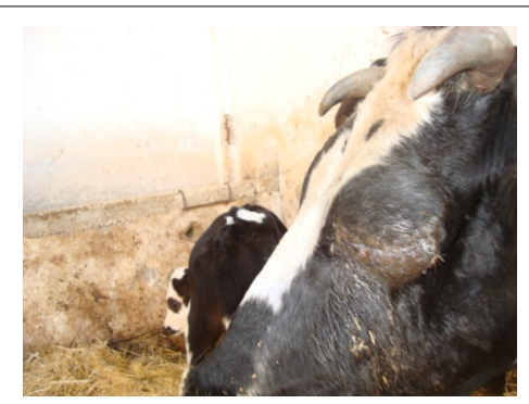
Figure 4: 30May, 2013 — eyeafter12 days of honey treatment.