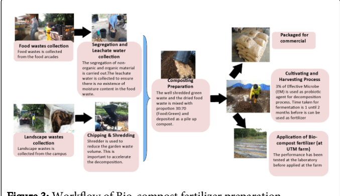
Figure 3: Workflow of Bio-compost fertilizer preparation.

Meanwhile, for animal feedstock, the collected food waste will undergo several steps before ready to be used as feedstock and for commercial packaging. The collected food waste will be manually segregated to separate the solid waste and food waste, the leachate collection, before its' nutrition enriched with the mixture of coconut pulp and wheat flour (for livestock growth rate), and allowed to dry before it can be applied for the livestock such as chickens, lambs and ducks at UTM farm. These products have been tested to livestock at the UTM farm and the result showed the higher nutrition content in the feedstock indicated a positive development towards the growth of livestock compared to the normal feedstock purchased from the external parties. The process involved as illustrated in Figure 4.