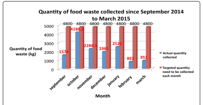
Figure 2: Quantity of food waste collected since September 2014 to March 2015.

Bio-recycling Centre is created to integrate the collection of wastes from various sources, such as food waste, green waste and solid waste, in order to promote the healthy lifestyle and further practicing the entrepreneurial spirit among university's citizen. Through some researches and sustainable practices, the implementation of Sustainable Arcade (Green Cafetaria) and Bio-Recycling Centre in UTM shows some improvement in the waste management since it was implemented on 2010. Through the UTM Campus Sustainability flagship project, a total of 9 researchers have conducted a 7 months research on project title "On-Campus Bio-Recycling Of Food and Green Waste Into Compost" in order to produce a feasibility report on scaling up the bio-composting process and also to scale up the current practice in amount of food waste collection (80 kg/day to 400 kg/day). This ongoing research has become a gateway for UTM functionality as a Living Laboratory towards Zero Waste Society and creating a small scale composting of food and green waste. The quantity of food waste (kg) collected since September 2014 to March 2015 has been recorded and presented in Figure 2. However, this data only represent for 2 sustainable arcades at that time, namely Meranti and Cengal.