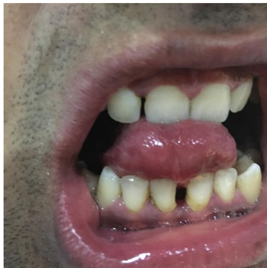
Figure 1. Preoperative view showing maximum protrusion of the tongue.

A 30 years old man presented with complaint of impaired speech and pronunciation since childhood.