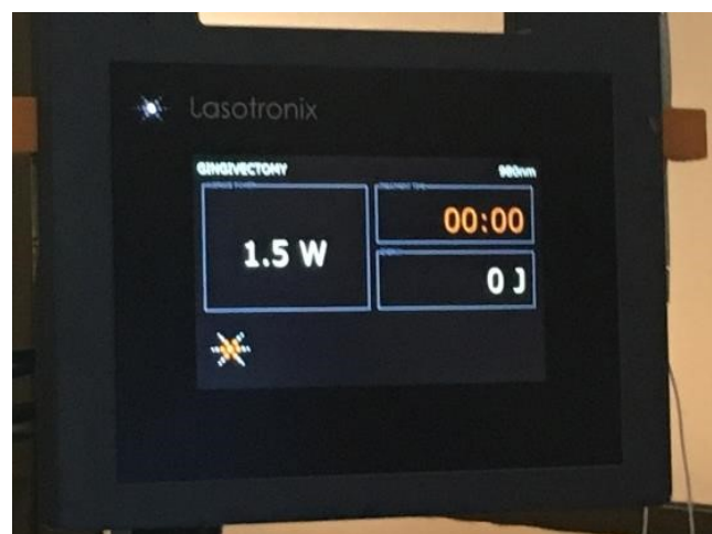
Figure 3. Diode Laser Parameters used for surgical procedure.

The surgical procedure of frenectomy was planned using a 980 nm diode laser. Informed consent was obtained from the patient. Topical anesthesia was applied with Lignocaine spray for 2 minutes. Eye safety measures were taken. Diode laser (Lasotronix Smart, Poland) was used in contact mode at 1.5-Watt power settings in continuous mode ( Figure 3 ).