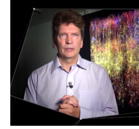
Figure 1: Henry Markram.

Normal and Virtual Brains differentiation is explained in Figure 4.