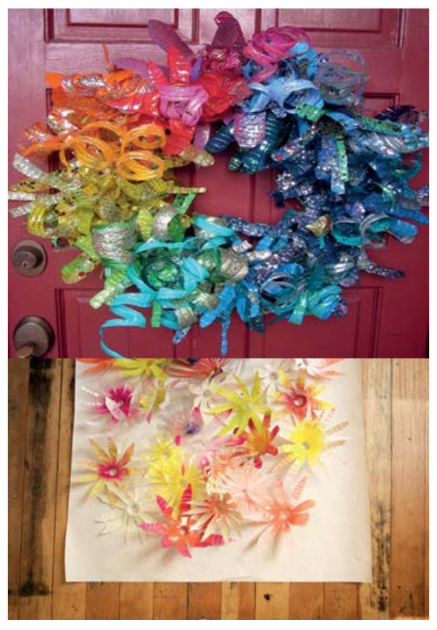
Figure 8: Cut into stings and color them then use as decorations all over you walls.