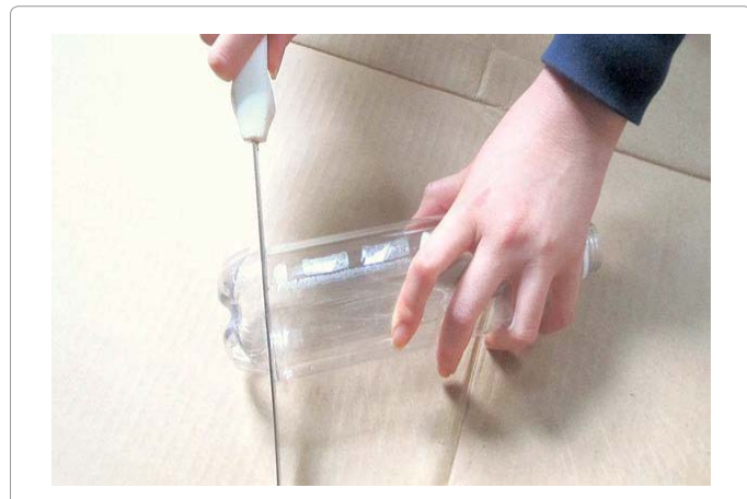
Figure 4: Make your own 1001 bottle-base-chandelier.