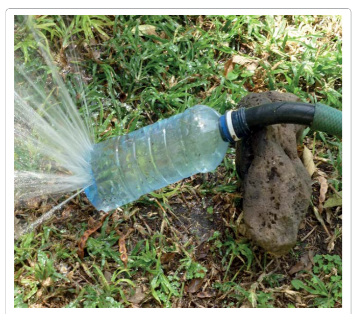
Figure 7: Turn it to your water regulator.