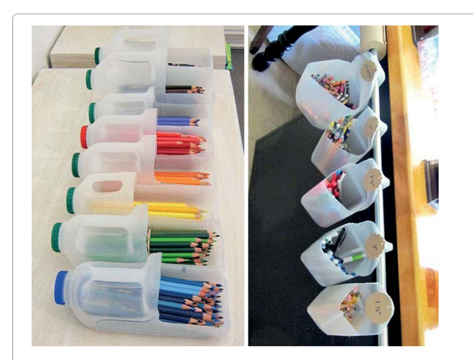
Figure 6: Turn it to your next pens/color organizer.