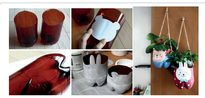
Figure 1: Turn it to a cutie-planter box.

Having a lot of useless plastic bottles and wondering what to do.? That's your thing then: 1/ Cut the base of the bottle then pick up from the following ideas what goes right for you (Figures 1-9).