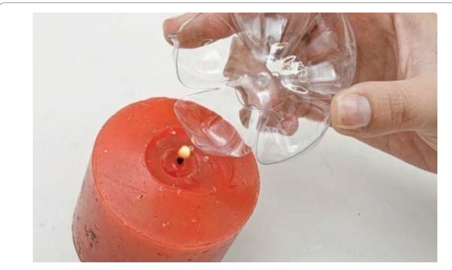
Figure 3: Turn it to a nice candle-box.