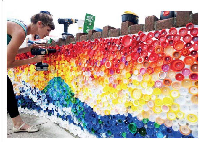
Figure 9: Sticky walls with waste