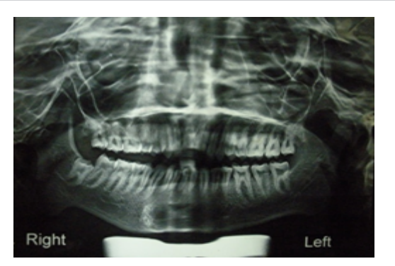
Figure 3: Pre-operative OPG showing right hypoplastic condyle.