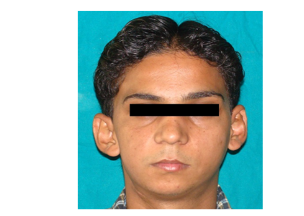
Figure 7: Post-operative front profile shows corrected facial asymmetry.