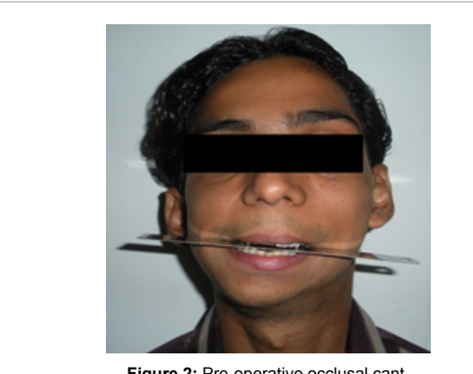
Figure 2: Pre-operative occlusal cant.