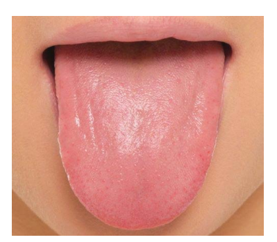
Figure 1: Infestation presented a clear crimson tongue.