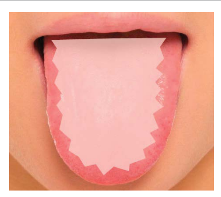
Figure 4: Patients having malaria + upper respiratory tract infection(s) present a tongue with a buffy coat that is crenated at the edges.

Malaria + menopause geriatric cases indicated the most virulence in infection and obstinacy to clearance. These cases require longer or loading doses (OMARIA). Menopause geriatric persons are the grand old dotting nannies of the large loose Indian joint families (all religions/