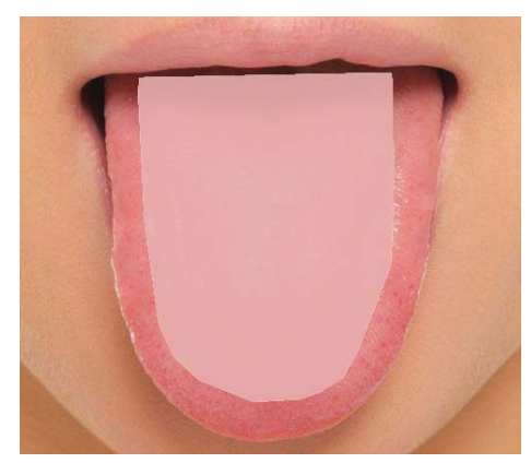
Figure 2: Part buffy coat is also noted during hepatic stage of the malaria parasite. Hence the patient is asymptomatic.