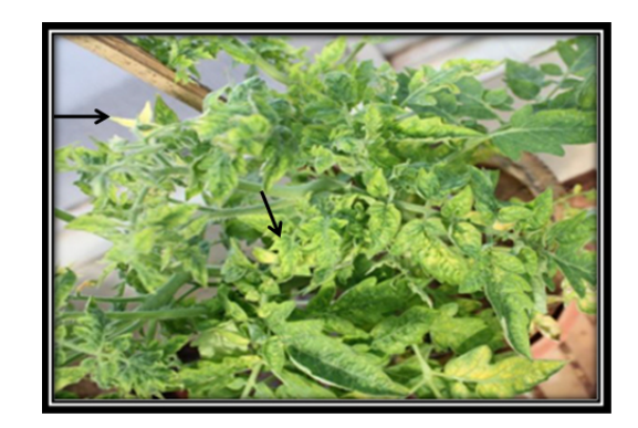
Figure 1: Tomato plant infected with TYLCV. Curling and pale color of TYLCV infected leaves are marked.