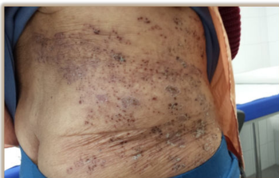
Figure 2: Hemorrhagic herpes zoster in a patient with dabigatran-induced thrombocytopenia, one month after discharge.

Segmental distribution of the painful cutaneous lesions suggested hemorrhagic herpes zoster, which was treated with oral valacyclovir 3 g/day for 10 days and local gentamicin application. The patient was discharged and dabigatran was replaced with warfarin. The skin lesions showed signs of a slow recovery after a few months (Figure 2).