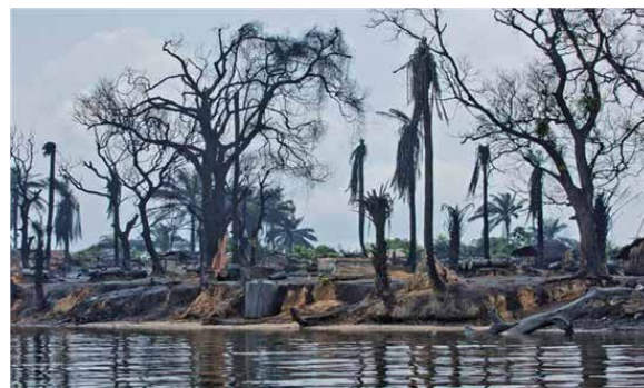
Figure 1a: The cumulative impact of artisanal refining puts significant environmental pressure on Ogoniland.