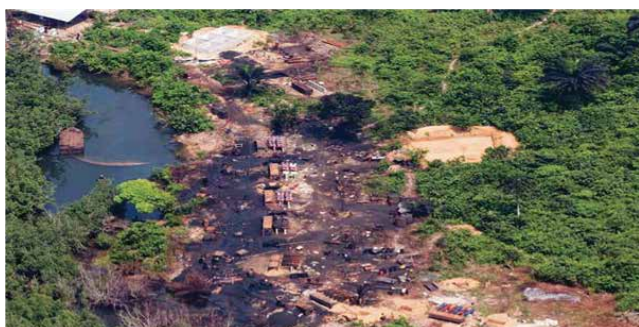
Figure 1b: Aerial view of artisanal refining site (Bodo West, Bonny LGA).