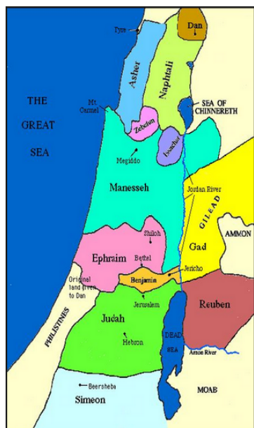
Figure 2: Urban land, Sanctuary cities.

Obviously, only a small minority of persons have exceptional voices with which to sing-even among Levites. So, only a small portion of the tribe could have qualified for the roles of singing. There existed other, additional, roles in the Temples for which Levite could be applied, such as guard duties, but these were quantitatively minor. No more than a few hundred at any time. Just as not everyone can qualify as a singer,