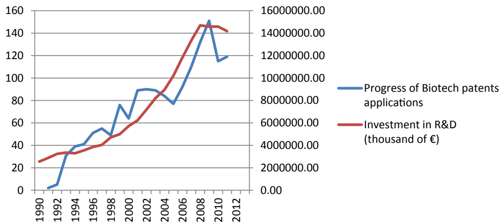
Figure 1A: Spanish biotechnology patent requests and Spanish investment in R&D, public and private investment.