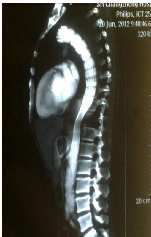
Figure 3: CTA at 6-month follow-up showed no leaks, effective remodeling of the true lumen, completely false lumen thrombosis in th stent implantation.

2 mm oversizing laser-cut nitinol stents was placed for distal extension of the previously implanted stent graft. In this case, our opinion was the collapsed descending true lumen had been compressed by the false lumen for ten years and would be better to