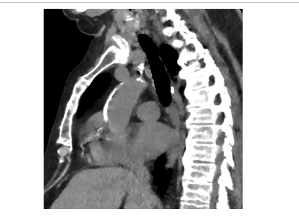
Figure 1: CAT scan without contrast showing severe calcification of ascending aorta.

in which often impaired renal function is found. An example of the findings in one of our patients is shown in Figure 1. All patients for minimal invasive mitral valve surgery, re-do procedures and minimal access aortic valve surgery had a CAT scan with contrast. We evaluated the effect of the implementation of preoperative Chest CAT scanning on operative strategy and the incidence of stroke. If the CAT scan showed