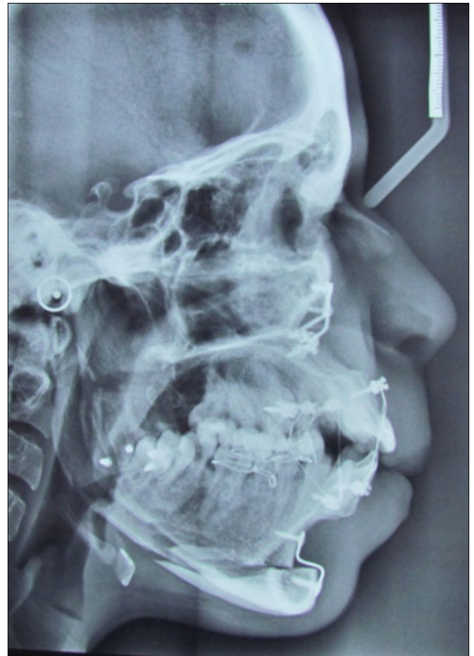
Figure 2d. Cephalogram taken after orthognathic surgeries.