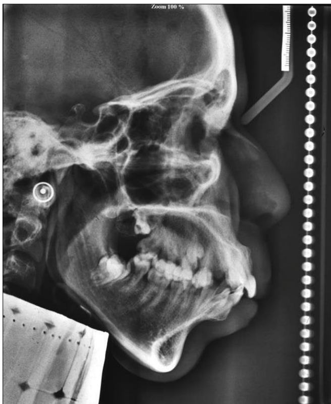
Figure 2c. Preoperative lateral cephalogram. SNA: 96°, SNB: 86°, SN-Pog: 76°, interincisal Angle: 120°, SN-FH: 7°.