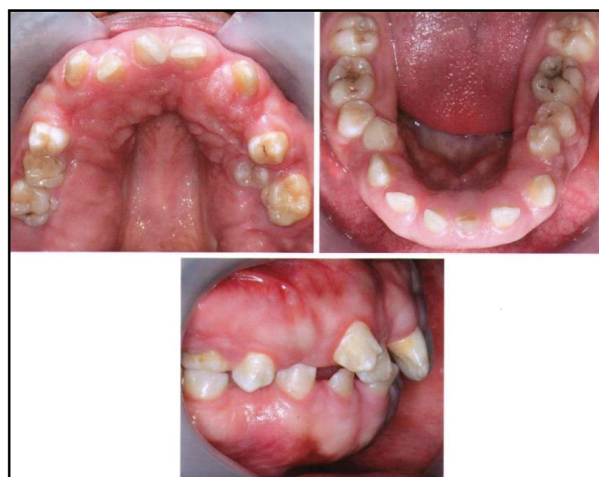
Figure 1. Gingival overgrowth with displacement and rotation of the teeth and diastema.

Pre and post-operative photographs and lateral cephalographs are illustrated at Figure 2 .