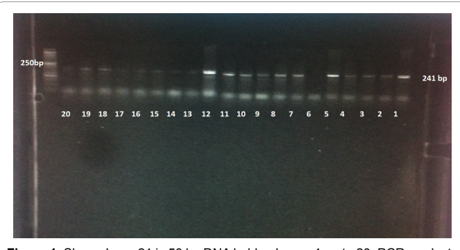
Figure 1: Shows Lane 21 is 50 bp DNA ladder. Lanes 1 up to 20: PCR products showing single band size 241 bp.

Polymerase chain reaction for 20210G>A gene yields a product sized 345bp. In the normal gene there was no restriction site for Hind III in the 20210GG allele and fragment of 345 bp was remain undigested, whereas 20210AA allele was digested into two fragments of 322 and 23 bp. Both patterns were detected when subjects were heterozygous (20210G>A). When the DNA sample contains the prothrombin mutation in homozygous form (20210 AA, genotype), only 322 bp fragment will be present in the gel (complete digestion).