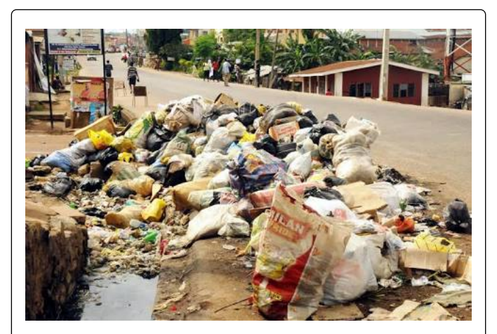
Figure 1: Solid Waste disposed on the streets.

to the amount of waste generated [8]. These waste generated as a result of increased consumption of resources can be very harmful to human and environmental health [9].