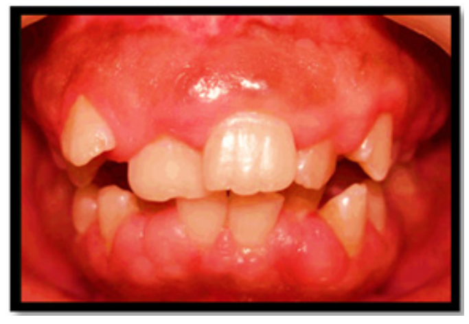
Figure 1: Gingival fibromatosis affecting both arches.

is affected, although it does not extend beyond the Muco-Gingival Junction (MGJ). GF may also appear as a localised lesion. The gingival overgrowth covers part of or the entire crown, resulting in diastemas, retention of primary teeth, teeth displacement, and sometimes can cause masticatory, phonetic, psychological, and aesthetic problems (Figure 1) [4].