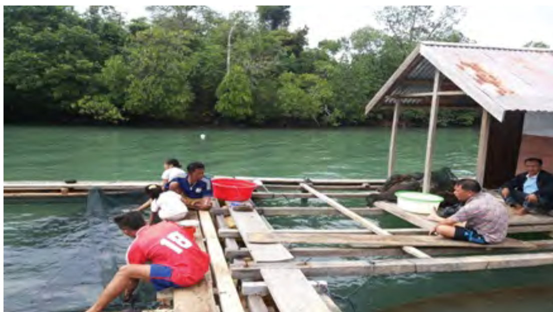
Figure 2: Construction of KJA.

Table 1 shows that the length or body weight of the bigeye trevally at the beginning of the maintenance period was not significantly different ( p>0.05 ), then towards the end of the 70 days maintenance period, especially in the body weight of the bigeye trevally weight showed significantly different growth results between treatments A, C and B ( p<0.001 ), but not significantly different between treatments A and C ( p>0.05 ). At the end of the study, the highest average body weight was achieved by treatment B, which was 219.78 \pm 39.84 (gr), and the lowest was achieved by treatment A (control), which was 169.22 \pm 45.18 (gr). In addition, the daily growth rate of the bigeye trevally in treatment B of 1% was greater than that of treatment A (control) of 0.67% and treatment C of 0.68% (Table 2). The effects of polyculture and the addition of corn oil in the feed appeared to have a significant effect ( p<0.001 ) on fish growth, especially the body weight of the bigeye trevally. The low growth rate in treatment A (control) is thought due to the monoculture maintenance system, while the low growth rate from treatment C is due to the lack of nutrient content in the feed given and both of these, both the monoculture maintenance system