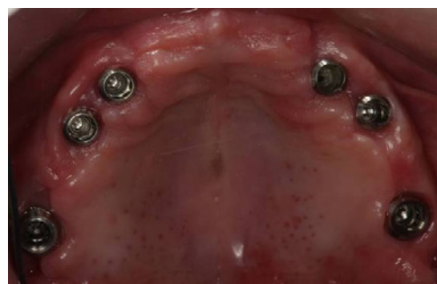
Figure 3: Detail of the distribution of the six Straumann® implants. The implants were placed at the level of 16, 14, 23, 24 and 26. Avoiding implants at the level of the upper incisors would prevent problems associated with hygiene, as this case involved a patient with a moderate Angle Class III.