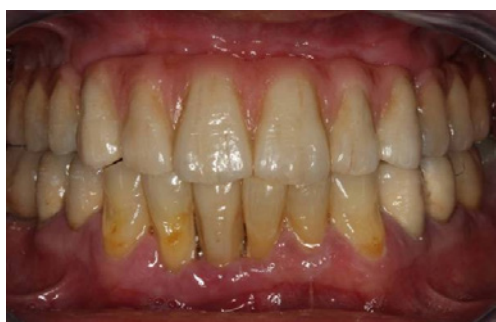
Figures 6: Intraoral rehabilitation aspect.