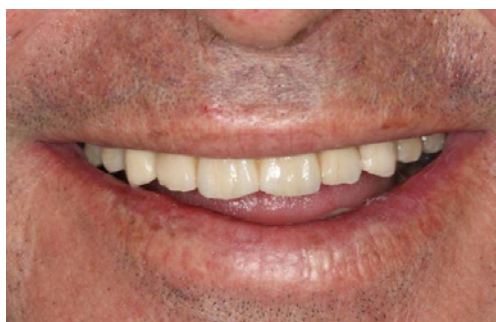
Figures 7: Extraoral rehabilitation aspect.

it possible to evaluate the patient's degree of lip support (lacking the support resin) and consider issues related to aesthetics and phonetics. Additionally, based on the analysis of the models in the articulator, it was determined that a tooth-supported fixed prosthesis with abutments in 33 and 43 was required—a procedure that would enable replacing the four missing lower incisors. The treatment choice was fixed prosthesis instead of an implant-supported prosthesis, given that the two inferior canine teeth were extruded, and in this manner, the alteration of the occlusal plane could be corrected [25]. Surgical extraction of 45 and immediate insertion of an implant during the same surgery was also planned. Based on the aforementioned reasons and after having evaluated the Denta-Scan, the surgical phase was carried out: