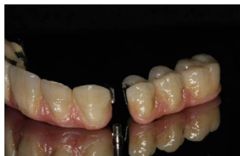
Figures 4: Detail of two of the sections of the rehabilitation (the posterior section that will be cemented on SynOcta® abutments to be cement-retained; and the anterior section that will be screwed into SynOcta® abutments to be screw-retained).