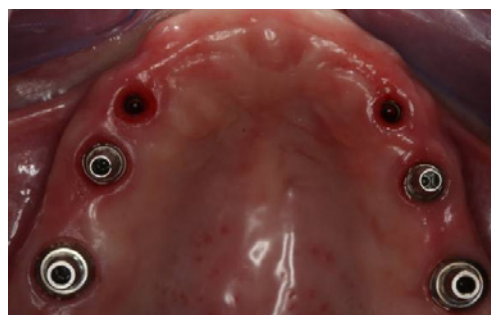
Figure 9: Detail of the clinical situation before insertion of the oral rehabilitation. In this case, bone level® implants were used at the level of 13 and 23, and tissue level® implants were used in the posterior areas.