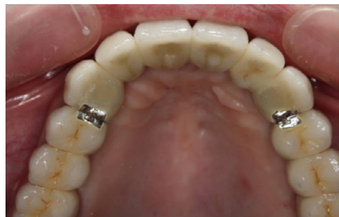
Figures 13: Intraoral aspect of the oral rehabilitation.