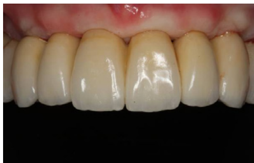
Figures 11: The selective and sequential pressure (note the temporary ischemia that occurs) allows proper conformation of the gums in the pontic area, which minimizes aesthetic and phonetic complications.