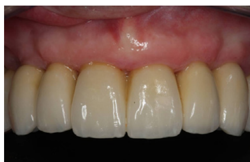
Figures 14: Image of the tissue formation in the esthetic area one month after the insertion of the prostheses.