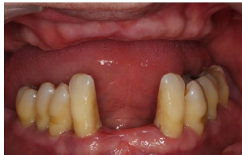
Figure 8: Initial intraoral image of the clinical situation to be rehabilitated. The patient presented advanced chronic periodontitis that was treated prior to commencing oral rehabilitation.

A diagnostic wax-up and an upper and lower surgical guide were created. In order to create the upper surgical guide, the full upper prosthesis was doubled (which was appropriate with respect to the lip support and the occlusal and aesthetic criteria) and a surgical-radiological guide was developed without a vestibular side, thus making