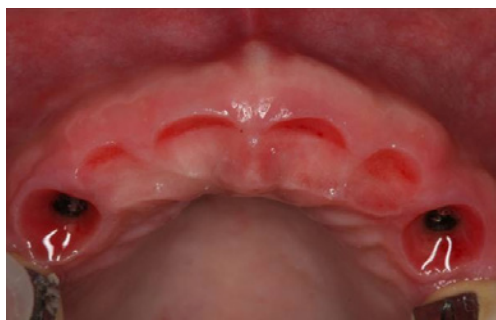
Figures 12: Aspect of the pontic area after remotion of the anterior FDP.