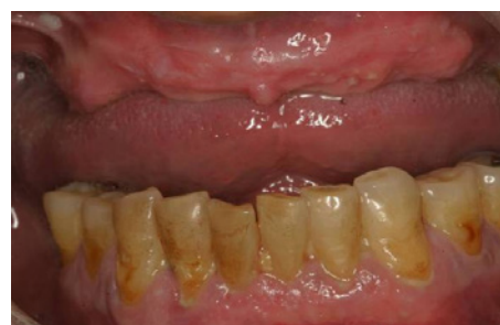
Figure 1: Initial clinical situation. The patient presented with moderate generalized and localized advanced chronic periodontitis. In a previous treatment, he had received an implant at the level of sextant III, which presented severe periimplantitis. A course of periodontal treatment was completed prior to the implant treatment.

A 63-year old patient who has type II diabetes (controlled by using hypoglycemics) and smokes 20 cigarettes per day, visits the clinic requesting oral rehabilitation. The patient has an edentulous upper maxilla, which had been rehabilitated in another clinic by means of an overdenture retained by an implant at the level of 27, but the result was not satisfactory for the patient. The patient's first and second molars were found to be absent in the inferior maxilla. The intermaxillary relationship was not favorable, as it presented a mild skeletal class III relationship. On the other hand, the patient suffered a generalized moderate chronic and advanced localized periodontal disease and periimplantitis, which had caused extensive bone loss in the aforementioned implant (Figures 1 and 2). The following course of treatment was carried out: