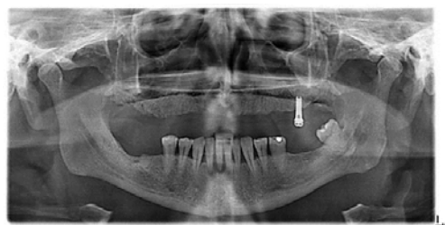
Figure 2: Radiological situation.