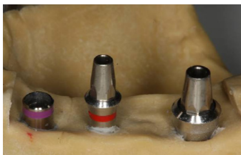
Figure 10: Appearance of the synOcta® abutments to be cemented and the analogous of the Bone level® implant, which will be an abutment for the anterior screw-retained section.