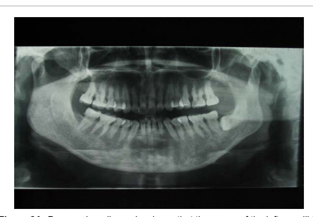
Figure 2A: Panoramic radiography shows that the ramus of the left mandible is vertically and horizontally smaller than the ramus of the right mandible.

under general anesthesia and by the same senior maxillofacial surgeon. Bilateral mucosal incision was made over the external oblique line, and the anterolateral portion of the masseter muscle was exposed. Masseter muscle attachment was loosened from the ramus of the mandible and coronoid process was also resected. To reduce the incidence of reattachment of muscle, we put part of buccal pad between mandible and masseter muscle. Part of masseter muscle was resected for histopathology examination. 1 week after surgery, mouth opening and closing training was initiated, which included passive mouth opening training.