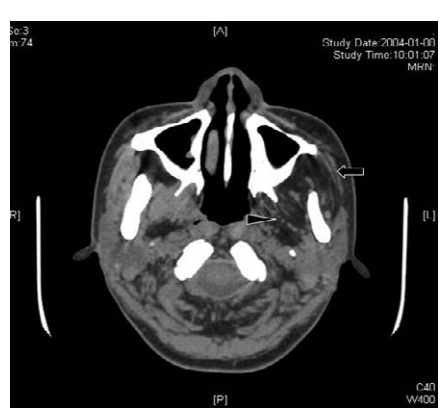
Figure 2C: CT showing atrophy of the left masseter (arrow) and lateral pterygoid muscle (arrowhead).