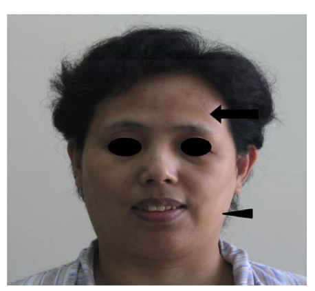
Figure 1A: Muscle atrophy of patient. Atrophic masseter (arrowhead) and temporalis (arrow) are shown.