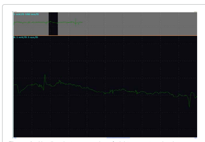
Figure 3: Needle electromyography of right masseter showing sparse fibrillation and positive sharp wave.