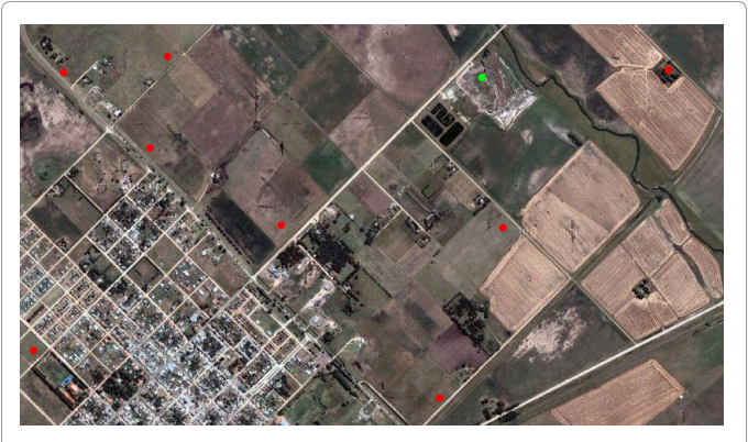
Figure 2: Shows the location of pig farms (red points) and the garbage dump (green point). Live traps were located around each pig farm making 4 lines of capture, each line consisting of 8 traps.

In Argentina, several authors have carried out studies in rodents. For example, Vázquez et al. [4] studied the prevalence of trichinellosis in rodents of risks areas in the city of Río Cuarto, Córdoba. All captured animals, a total of 1253, were controlled through artificial digestion and had negative results. Studies carried out in trichinellosis pork focus groups in the province of Río Negro found 15% of infected rodents [10], which matches the hypothesis claiming presence of infected pigs/infected rats. In another study, carried out in chicken farms in Exaltación de la Cruz, province of Buenos Aires, the absence of T spiralis in 152 individuals of R. norvegicus suggests the hypothesis of rodents as accidental hosts, which can acquire the infection through the consumption of infected pig carcasses. In this case, the high availability of rat food (chicken food) decreased the probability of eating infected pigs carcasses [11]. In the current research food availability could be an explanation why there was no positive rat captured in any of the pig farms studied (Figure 2).