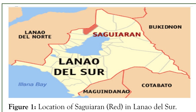
Figure 1: Location of Saguiaran (Red) in Lanao del Sur.

The study was conducted at Brgy. Poblacion, Saguiaran, Lanao del Sur. Pindolonan is a barangay in the municipality of Saguiaran, in the province of Lanao del Sur. Its population as determined by the 2020 Census was 535. This represented 2.00% of the total population of Saguiaran (philAtlas.com). The location was chosen because it will be useful for the research as it proposed vital material to determine how the continuous growth of households organizes and conducts their proper waste management and practices with the utilization of the local government unit (Figures 1 and 2).