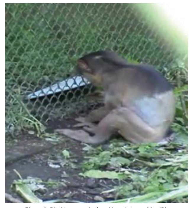
Figure 3: Plucking grass, leaf, and insects in condition 'B'.

support survival effort rather than produced serious injuried-body.