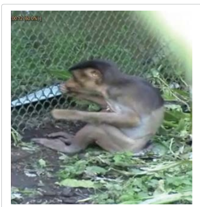
Figure 4: Eating grass, leaf, and insects in condition 'B'.