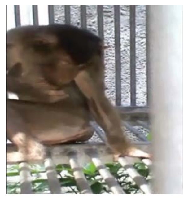
Figure 2: Eating the hair when tick was not reachable in condition 'A'.