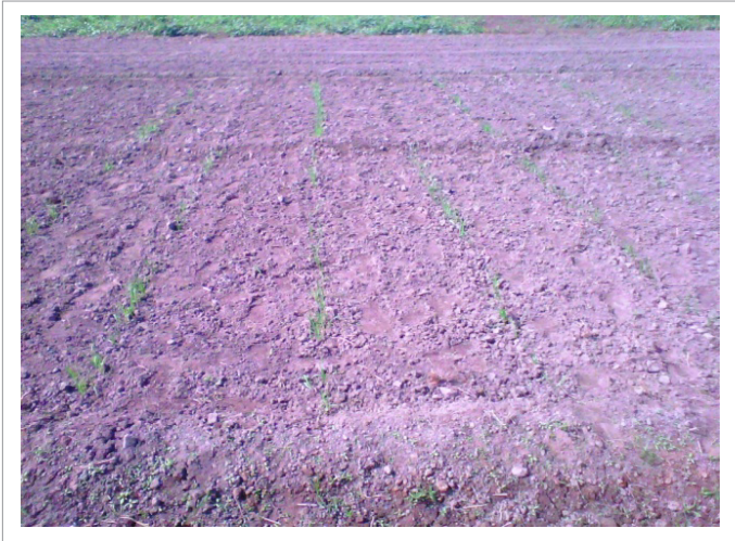
Figure 1: Advance spreader row planting.

kept 20 cm and the experimental test material was sown 20 days after the planting of spreader rows i.e. on 5<sup>th</sup> November 2010 in between the spreader lines (Figure 2) and separately in an isolated normal plot. Each test entry was represented by 40-45 plants in a 2 m long single row in spreader plot. Artificial inoculation was done at 20 days of planting of spreader rows, by spraying the solution of crown rust spores, cultured from previous year's infected oat leaves, over the