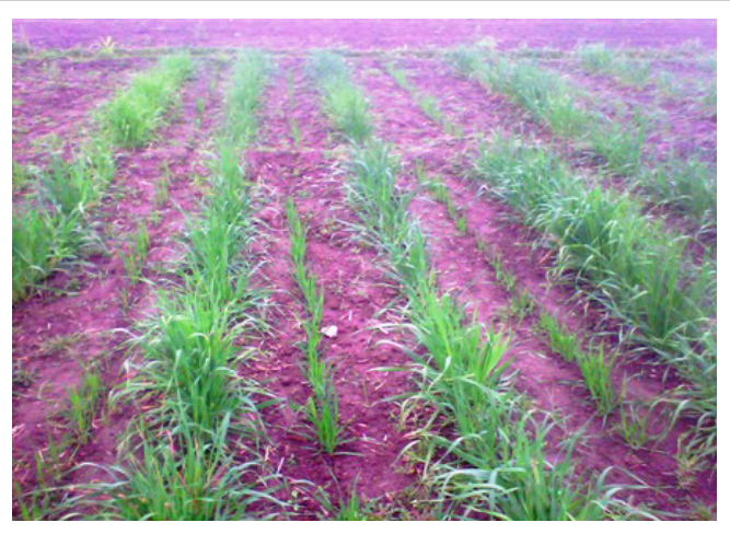
Figure 2: Spreader row along with test entries.