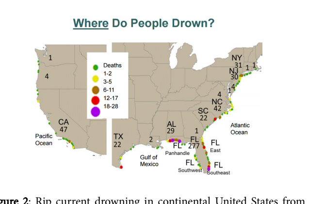
Figure 2 : Rip current drowning in continental United States from 1994 to 2012 [2], not including the Great Lakes that average about 10 rip fatalities per year (June 16, 2016).

Florida is the rip drowning capital of the United States (Figure 2) [2].