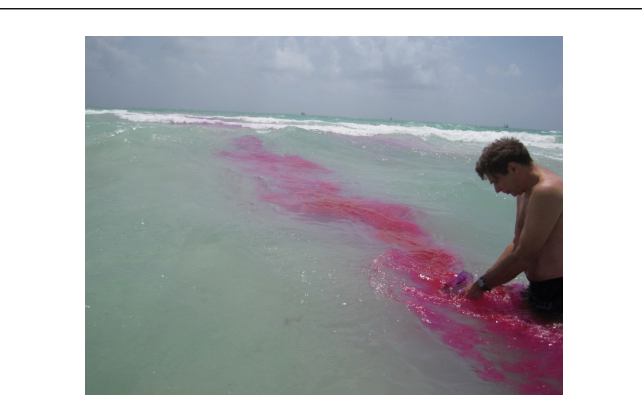
Figure 1 : A "clear-water" rip current at Miami Beach, Florida as delineated by red fluorescent tracer dye.

The rip current that drowned the two men was a "clear-water" rip-it contained little to no sediment and therefore was nearly invisible and hence very difficult to observe (Figure 1).