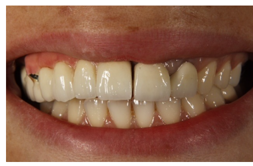
Figure 1: Existing denture of the patient.

A 29-year-old female patient was referred to the Department of Prosthodontics, Istanbul University, and Faculty of Dentistry for dental rehabilitation. The patient's history revealed that she had a dentigerous cyst defect. She had been wearing a removable partial denture with precision attachment for 6 years and complained about the insufficient esthetic, function and comfort (Figure 1). Intraoral examination revealed the lack of the maxillary anterior residual ridge on the right side, with the loss of maxillary right central and lateral