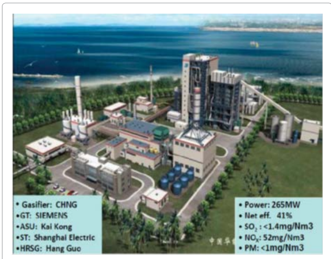
Figure 2: Huaneng Tianjin GreenGen 400MW IGCC project.

Table 1: Main CCS demonstration projects in P. R. China.