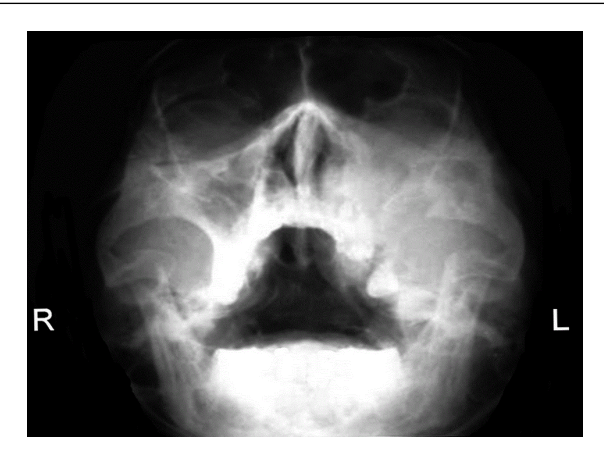
Figure 3: Opacification of left maxillary sinus as seen in Water's

The patient was referred to the radiology department, where plain computed tomography was performed. The CT scan confirmed the sinus destruction supporting the diagnosis of maxillary antrum carcinoma with invasion into the hard palate, nasal cavity and infratemporal fossa (Figure 4). Macroscopic examination of specimen revealed a firm mass measuring 25 mmx15 mmx12 mm that was attached to the roots of the maxillary first molar