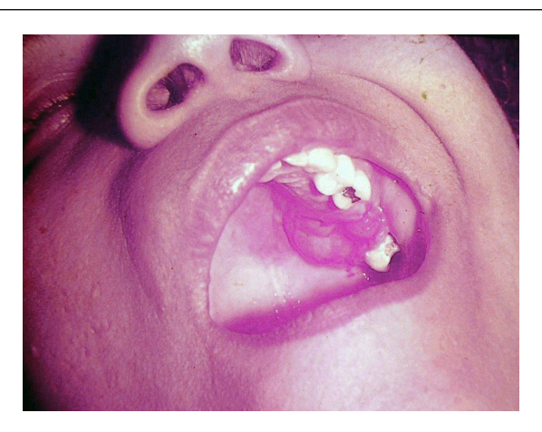
Figure 2: Extraction wound on the third day

Clinical examination on the third day revealed extraction sockets with friable granulation tissue showing no signs of healing (Figure 2). The area adjacent to the extraction socket was mildly painful and tender to palpation. No lymph nodes were detected in the neck region. On radiographic examination (Water's view) the entire left maxillary sinus showed opacification as well as destruction of the inferior, posterior, lateral and medial walls of the sinus (Figure 3).