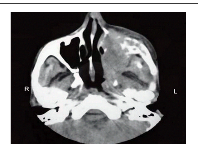
Figure 4: Axial view CT showing expansive lesion centered on the left maxillary sinus

The patient was referred to the radiology department, where plain computed tomography was performed. The CT scan confirmed the sinus destruction supporting the diagnosis of maxillary antrum carcinoma with invasion into the hard palate, nasal cavity and infratemporal fossa (Figure 4). Macroscopic examination of specimen revealed a firm mass measuring 25 mmx15 mmx12 mm that was attached to the roots of the maxillary first molar