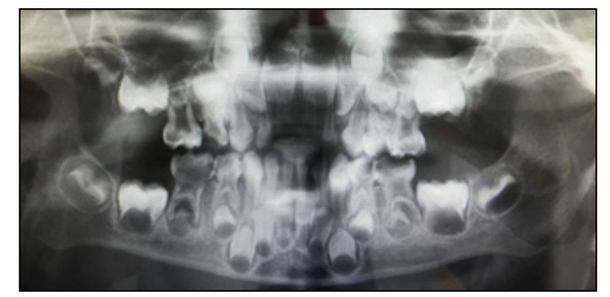
Figure 2. The panoramic radiography reveals the primary first taurodont mandibular molars bilaterally.