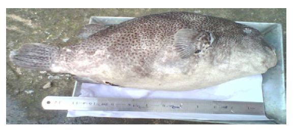
Figure 5: Arothron stellatus.