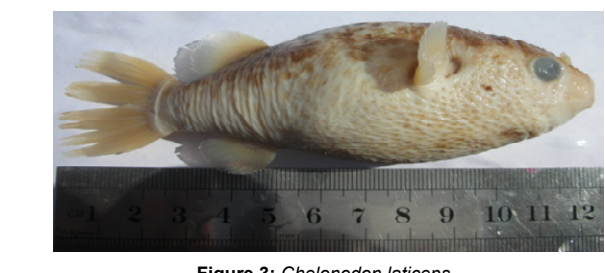
Figure 3: Chelonodon laticeps.