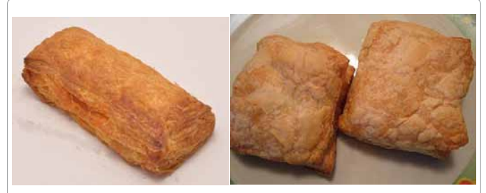
Figure 2: Sensory analysis report-Laminated Baked Product using Oats.

The procedure for the preparation of double baked oats product was standardized. The dependent variable or response measured for