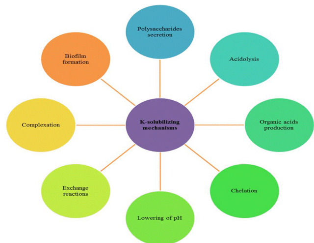
Figure 2: K-solubilizing mechanisms in soil system.

Efficient rhizospheric microbes (ERMs) have the higher ability to solubilized mineral sources. This involved the adsorption of K^+ on to sites in the inter-layers of silicate minerals, such as illite, vermiculite and montmorillonite K-solubilization accompanied by acidolysis as well as complexolysis exchange reaction [7,9]. The K-solubilization through KSMs was studied by various researchers repeatedly (Figure 2). They solubilize K-minerals through different mechanisms including (i) polysaccharides secretion, (ii) biofilm formation, (iii) chelation, (iv) acidolysis, (v) organic acid production, (vi) lowering of pH, and (vii) exchange reaction [2,10]; The rhizosphere is the close vicinity of the root surface, that affected by root exudates. Thus, the uses of KSMs as K-biofertilizers in crop, it reduced the use of agrochemicals and support ecofriendly agriculture [2]. Therefore, it is imperative to isolate efficient KSMs to enrich the pool of K-solubilizers species and genes as K-biofertilizers, which will be of great benefit to ecofriendly agriculture. The improvement in KSMs diversity may bring several direct and indirect mechanisms in the soil biological environment [11]. Bio-primed seed may serve as an important means of managing many soil and seed borne diseases as well as enhanced NUE [12].