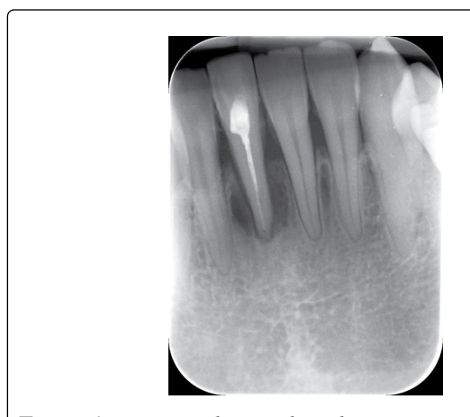
Figure 4. Root canal treated tooth.

The radiographic finding of a well-defined periapical radiolucency associated with tooth 41 is suggestive of periapical lesion of endodontic origin. The tooth did not have any evidence of caries, restorations, cracks or fractures, however there was evidence of a wear facet on the lingual surface that was likely caused by the oral piercing. The literature suggests that the size of the piercing, the length of time it is worn and patient habits have the greatest influence on complications [3,4,9,10]. This patient has had a large metallic tongue piercing for a period of 11 years and describes frequent moments in which it would knock against the mandibular teeth. Thus in the absence of any other clear cause, it is entirely likely that over time, the tooth suffered repeated traumatic insults from the large metallic piercing, rendering it non-vital and resulting in a periapical lesion. It should be noted that in the absence of a biopsy, a true histological diagnosis is not possible. Thus, this lesion may represent a periapical abscess a granuloma or even a radicular