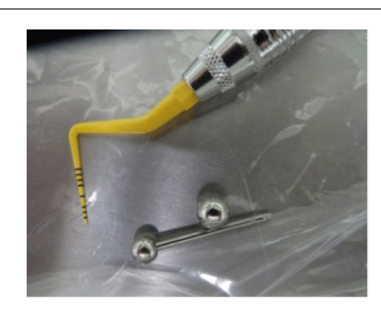
Figure 2. Metallic barbell piercing.

Clinical examination revealed grade two mobility of tooth 41. The buccal and lingual gingival mucosa were slightly inflamed and displayed 5mm of recession on the buccal surface, and 6mm of recession on the lingual surface. A wear facet was evident on the cingulum area of tooth 41. There was no evidence of any caries, cracks, fractures or discolouration. The tooth was not tender to percussion and thermal testing revealed a sluggish yet positive response to cold stimuli.