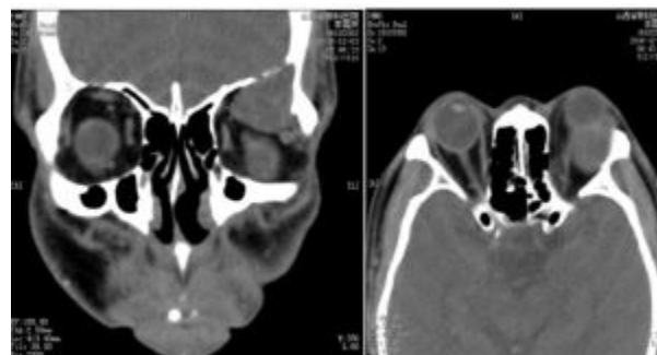
Figure 1: Orbit computed tomography scan of cholesterol granuloma.

frontal bone erosion with irregular border; infiltration of the zygoma bones (Figure 1).