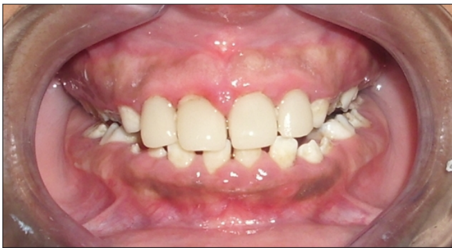
Figure 7. One year after orthodontic treatment.

attractive restorations earlier in their adolescence, in order to appear most "ordinary" to their peers at an important time in social development.