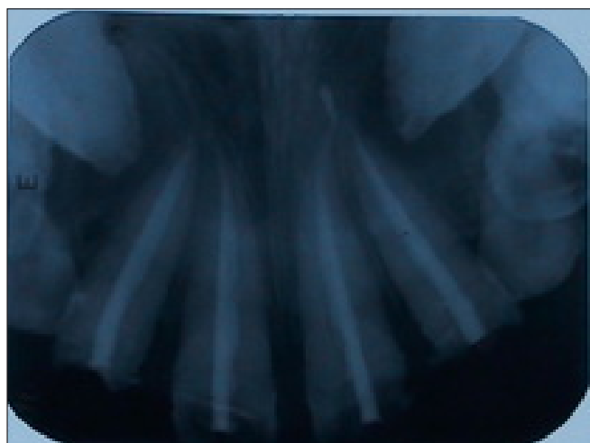
Figure 4. Root canal treatment of maxillary incisors.

The initial stage was periodontal therapy and consisted of scaling, root planning, and oral hygiene instructions. One month later, the gingival edema was resolved and hyperemic appearance of gingiva turned to normal. Also bleeding on probing was normal. All incisors were subjected to root canal treatment ( Figure 4 ), root reinforcement using fiber optic posts (3M ESPE-USA), and composite build-up to withstand future crowns. This decision was considered based on the poor long term prognosis of these teeth as they were crumble and had signs of pulp involvement. Teeth were non vital as determined by electric pulp tester.