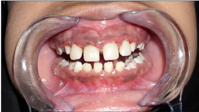
Figure 6. CEREC crowns cemented in the patient mouth.