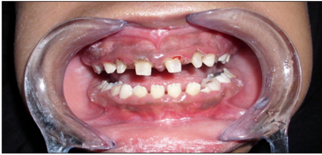
Figure 5. prepared anterior teeth ready for CEREC crowns.