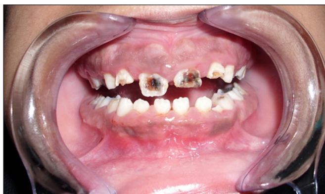
Figure 1. Starting position of the patient with AI.