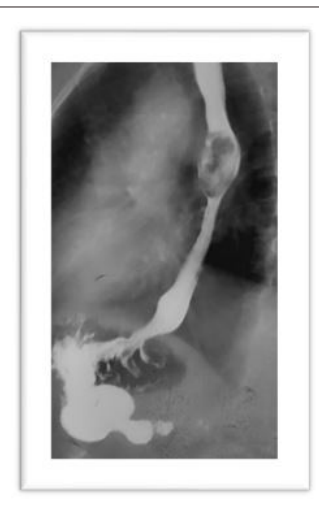
Figure 1: Well defined smooth outlined filling defect in mid esophagus (arrow).

5 × 3 cm intraluminal polypoidal growth at the mid oesophagus [3]. Post-operative period had gastroparesis for 7 days, managed with prokinetics and discharged on post-op day 15. Histopathology turned out to be carcino-sarcoma. Received 45 by of radiotherapy and 6 cycles of cisplatin and 5FU, no side effects noted [4]. After follow up of 3 months developed grade 2 dysphagia due to anastomotic stricture, improved with endoscopic dilatation in two sittings. At 10 months follow up, patient is asymptomatic, with no clinical and radiological evidence of recurrence (Figures 1-3).