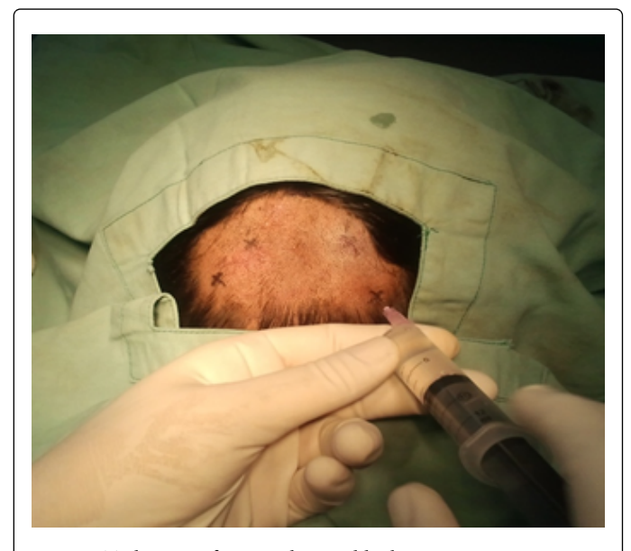
Figure 2: Technique of occipital nerve blocks.

Patient is given an anxiolytic dose of diazepam or alprazolam in the night before block. Following Informed consent, diagnostic local anesthetic nerve block of greater and lesser occipital nerve is performed. Patient is given either sitting position with head flexed or can be performed in lateral or prone position. A point is marked midway on the superior nuchal line and the mastoid process. The nerve exits approximately 3 cm below and 2.5 cm laterally from the occipital protuberance called as inion and runs medial to the occipital artery. Pulsation of the occipital artery is felt for identifying the nerve position. Another point is marked 2.5 cm below and laterally to block the lesser occipital nerve (Figure-2).