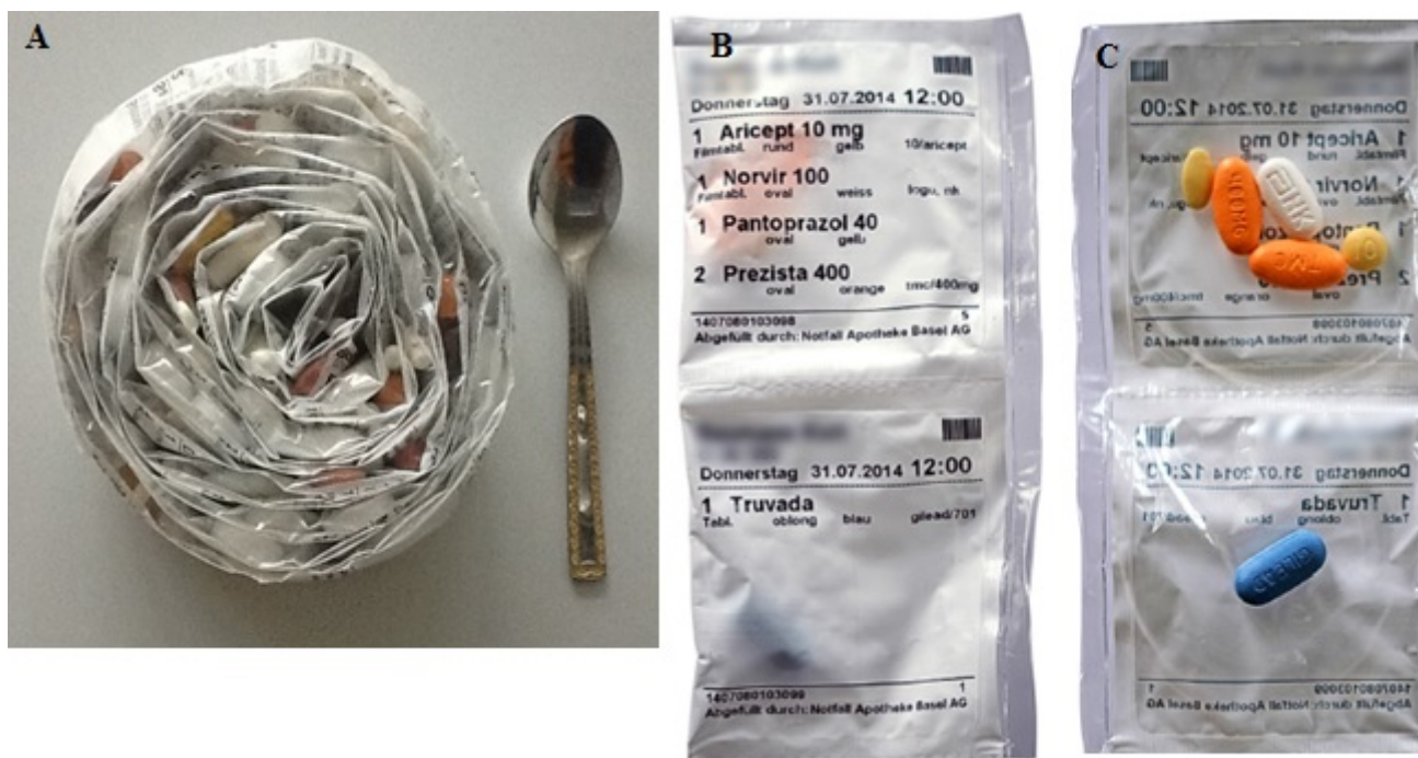
Figure 1: Unit-of-dose pouches with prepacked oral solid medication as roll (A), two pouches from front-side (B) and back-side (C). Note: patient’s name and date of birth were concealed for privacy reasons.

Solid oral prescription medications are repacked into unit-of-dose pouches (Automatic Tablet Dispensing and Packaging System, Desk Type JV-30DE, HD-Medi, Germany). Each pouch is imprinted with the patient’s data (name, date of birth) and medication data (number, name, date and time for intake, color, shape of the medication; Figure 1).