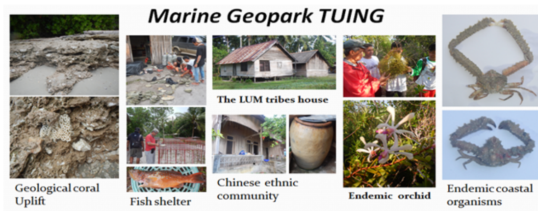
Figure 3: Marine Geopark for Tuning coastal village.