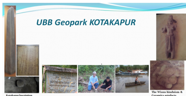
Figure 6: Marine geopark cluster of 'Kota Kapur' Maritime Anthropology – Bangka.

Marine geopark for Seliu island had found a very strong kind of islands life style, boats, fisherman houses and most specific is the presence of many type of old wooden stage-houses.