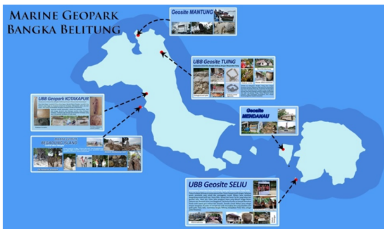
Figure 2: Map of Bangka Belitung Marine Geopark Development Plan.

Map of the overall Bangka Belitung Marine Geopark development plan as in Figure 2. The main concept of the study was development of marine geopark based on the integration of each geosite development plan that should have its different and characters of its natural granite rock types, endemic flora (many types of herbal flora), coastal and marine fauna, ancient tribe, maritime anthropology or socio-cultural heritages (such as old-spell or the 'Mantra', songs, Dam-bus music instruments, the 'Kedidi' dances), old wooden houses.