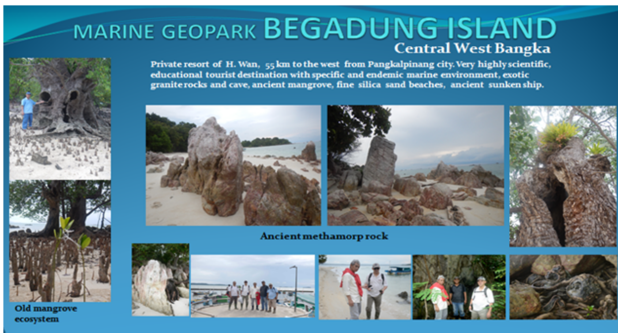
Figure 4: Marine Geopark of Begadung islands – west coast of Central Bangka.

Marine geopark of Begadung islands (Figure 4), central west coast of Bangka was characterized with unique type of Ancient vertical layering reddish sedimentary-low grade meomorphic rock types. Sedimentary rocks caves going to below sea water level, make it very challenging to