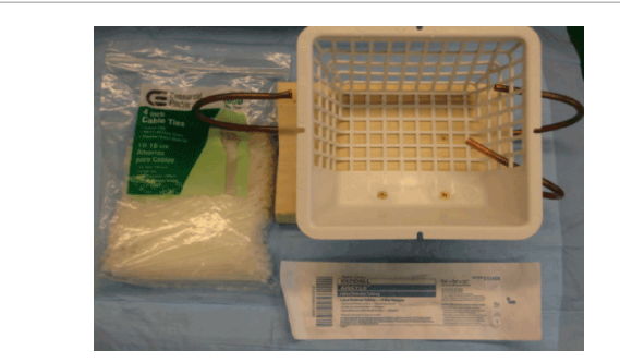
Figure 1: Vascular Trainer- View 1.