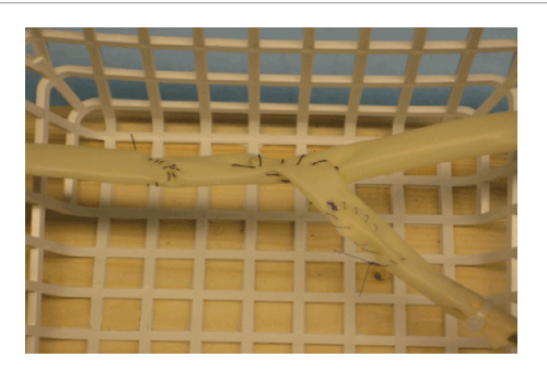
Figure 4: Vascular Trainer - View 4.