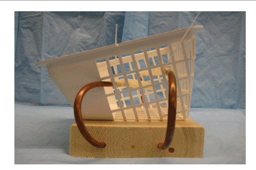
Figure 3: Vascular Trainer - View 3.

14/26 participants responded for total response rate of 54%. The number of vascular anastomoses performed prior to the workshop was 0 for 86% of respondents. During the workshop participants performed an average of 3 anastomoses and participated in an average of 6 anastomoses. On a visual analog scale of 1-100 mm (1=no ability; 100=high ability of expertise) the respondents were asked to rate their ability to perform a vascular anastomosis prior to and after using the simulator (Figure 6). These results were statistically significant using a paired Wilcoxon matched-pairs rank sum test (p=.009) (Figure 7). Additionally, the trainer rated highly regarding ease of use, durability, and realism by learners (Figure 3). 100% of respondents would like to have the simulator for personal use. 71% of respondents (10/14) were willing to pay for the simulator, with the average price being $25 per unit. 86% (12/14) of respondents reported they would be comfortable