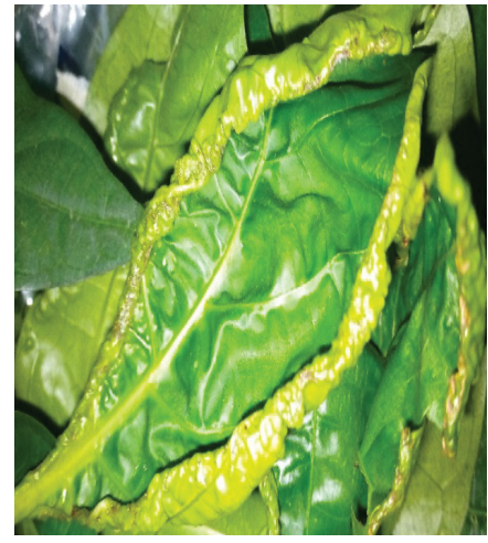
Figure 1: Foliar infection of noni (shrinking upward and inward) as observed at Dilomat farm.