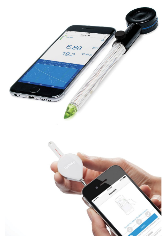
Figure 1: The examples of commercially available mobile-phone-based portable analytical devices: A - The pH probe with Bluetooth technology (http://hannainst.com/halo), B - The electrochemical portable glucose meter employing blood glucose test stripe, which plugs directly into the smartphone's headphone jack, and displays results directly on the phone screen [11].

biofilms in mouth. Two examples of such commercialized devices are showed in Figure 1. This outstanding, rapid progress in design of such systems results in increasingly sophisticated constructions, dedicated to different field of analytical applications, of which several will be presented briefly below. For medical purposes a microfluidic-based smartphone dongle with cassette with five optical detection zones was developed for simultaneous colorimetric determination of hemoglobin and detection of HIV antibodies with an immunoassay, based on silver precipitation on gold colloids [11] (Figure 2A and 2B). In instrumentally much simpler measuring system, the colorimetric detection employing silver nanoparticles was reported for the determination of local anesthetic lidocaine. It was based on the reaction carried out in Eppendorf vials, collecting the signal images in a safety cabinet by smartphone, and further signal processing in Adobe Photoshop software [12]. A much more sophisticated smartphone-based colorimetric system was recently reported and tested for the determination of human albumin [13]. In this case, a three-dimensional printed centrifugal microfluidics, mounted on a microcentrifuge was designed for ELISA immunosorbent assay with smartphone-based measurements. Also microfluidic chip, but with four arrays of 15 reaction wells was developed for carrying out a smartphone-based genetic testing, employing fluorescent DNA binding dye [14].