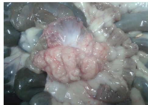
Figure 1: Lipoma. Whitish-yellow lobulated tumoral mass is in the abdominal cavity.

At the examination of the abdominal cavity, ileal mesentery in the lower abdominal cavity was covered by a whitish-yellow tumoral mass, which was coarsely lobulated and soft, with 11 × 8 × 4 cm dimensions (Figure 1). In addition, thickening and corrugation of the intestinal mucosa and enlargement of mesenteric lymph nodes were more evident in the ileum than other parts of the intestine.