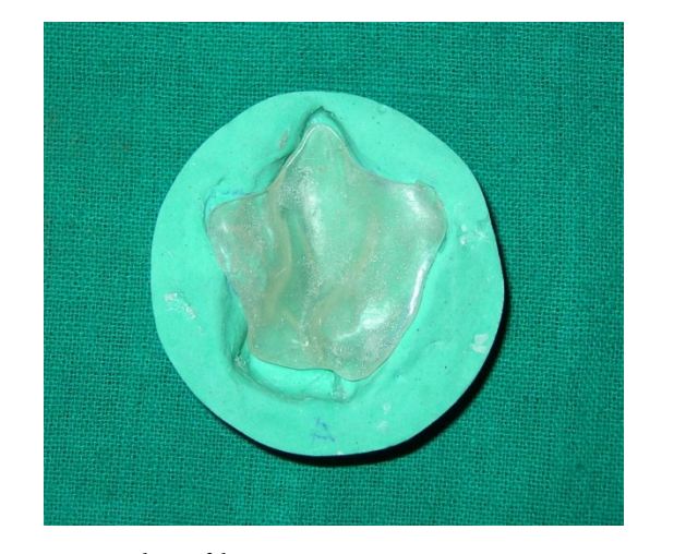
Figure 4: Special tray fabrication