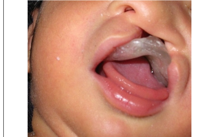
Figure 7: Feeding plate placed in mouth

attached to the feeding appliance to prevent swallowing and easy retrieval of appliance.