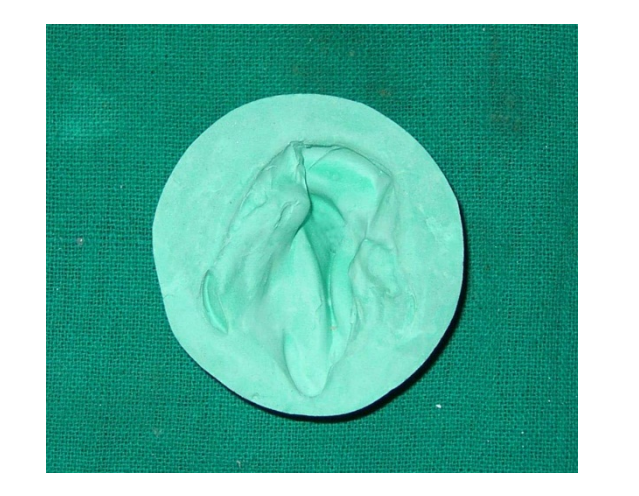
Figure 3: Operating model of inner surface

The corrective prosthesis was tried within the clinic and the patient's mother was asked to feed the baby. There was no nasal regurgitation noted [4]. The feeding plate was then delivered and the infant and a follow up visit was done 24 hours after delivery and after 1 week. On recall visit the baby was able to take oral feed well and there have been no other complaints of discomfort. The baby's weight on recall visit was found to be 3.0 kgs. And therefore the parents were happy concerning the gain in weight. A new feeding prosthesis ought to be made every three months approximately to accommodate the facial growth of the baby [2].