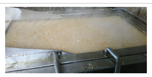
Figure 6: Frying.

size [3]. The packaging must be sealed airtight or using nitrogen which maintains the chips for a longer period of time (Figure 6).