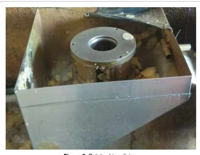
Figure 3: Potato chips slicing.

Chips after frying received in a tray of rectangle size and distributed homogeneously so that each piece of chips will get proper cooling. After 3-4 minutes chips get cooled and it becomes crispy. After this packaging is carried by putting the chips in the plastic bags of required