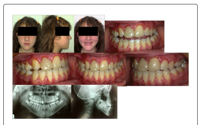
Figure 4: Post-treatment extraoral - intraoral views after two years

Post-treatment extraoral photographs show a general improvement in the facial profile. Facial aesthetics were improved by reducing the prominence of the lower lip. Maxillary incisor proclination resulted in protrusion of the upper lip. Post-treatment intraoral photographs show satisfactory dental alignment and acceptable overjet and overbite. The patient was satisfied with her teeth and profile. Good intercuspation, interproximal contacts and satisfactory root parallelism were achieved (Figure 4).