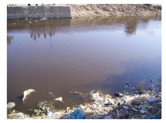
Figure 8: Large quantities of garbage accumulated on both sides of Mariotteya water.

physicochemical parameters of the sampling sites along Mariotteya stream. It is obvious that, the mean values of the different parameters of water in sites 1, 2, 3, and 4 were very high with the exception of temperature and PH while the parameters at site 5 South to Sakara 7 were within the permissible limits except for PAHs. The result also showed depletion in oxygen content in all sampling sites.