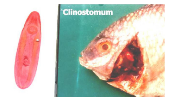
Figure 12: Clinostomum spp metacercarae in branchial cavity.

population. Parasites can cause mechanical damage (fusion of gill lamellae, tissue replacement), physiological damage (cell proliferation, immunomodulation, detrimental behavioral responses, alteration of growth) and also reproductive damage [43]. In addition, zoonotic parasites have considerable human hazard impacts resulted in pathological lesions and diseases [44,45].