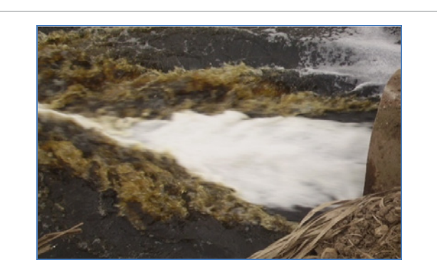
Figure 1: Al-Hawamdeya outlet (Site 1).

Pre-cleaned polyethylene sampling bottles (1.5 liter capacity) were immersed about 50 cm below the water surface, 500 ml of water were taken at each sampling site and acidified on spot with 10% nitric acid then transported immediately to the laboratory in an ice bath and prepared for analysis as described by APHA, 1998. The water samples were physically examined for colour and temperature (°C) which are measured by a dry mercury thermometer. For Chemical parameters, hydrogen ion concentration was measured by Orion Research Ion Analyser 399A PH meter, dissolved oxygen (DO) was measured using