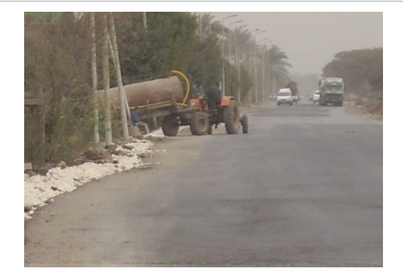
Figure 7: Tanked car dumping sewage material into Mariotteya stream.