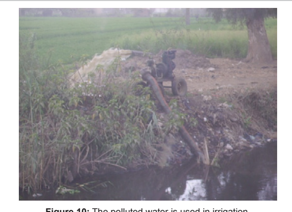
Figure 10: The polluted water is used in irrigation.