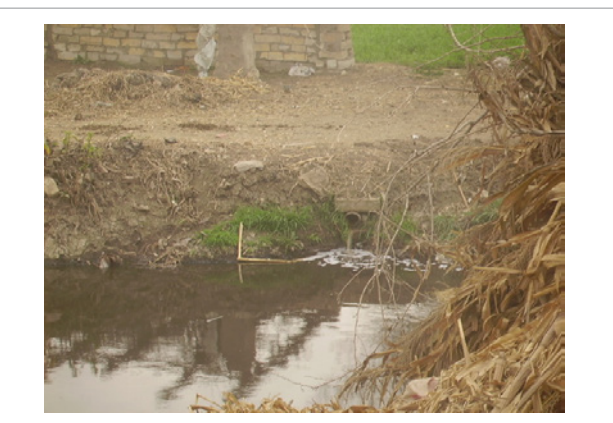
Figure 9: Pipes dumping wastes from houses into Mariotteya water sream.