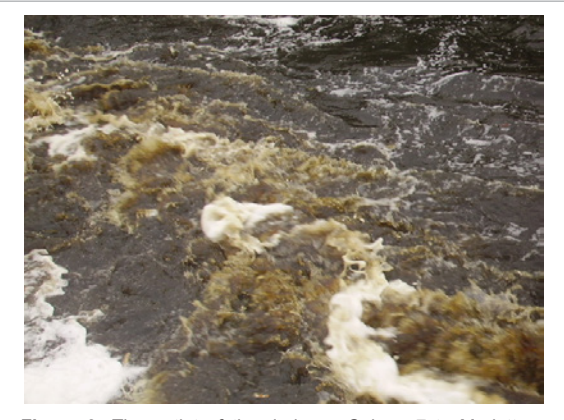
Figure 3: The outlet of the drainage Sakara 7 to Mariotteya water stream (Site 3).