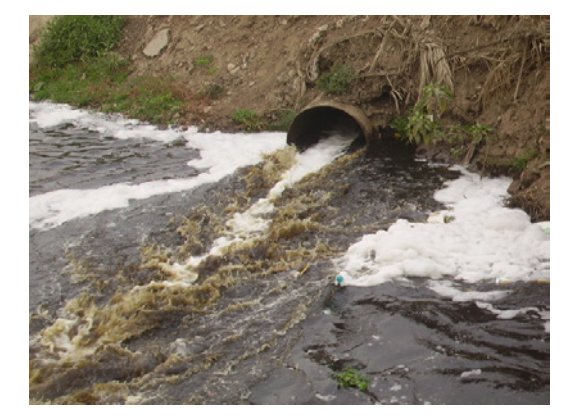
Figure 2: Drainage of sewage treatment plants (Site 2).