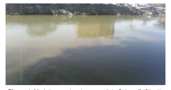
Figure 4: Mariotteya water stream north to Sakara 7 (Site 4).