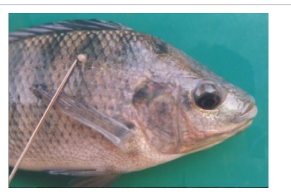
Figure 11: Nodule of Myxobolus dermatobia in skin.

Parasitic species can be found on every living organisms, their presence in their hosts is generally at equilibrium in aquatic ecosystem [42]. When natural or anthropogenic changes either environmental such as temperature, climate, or anthropogenic such as pollution and urbanization occur it can change the state of balance of the parasite between host and nature, thus resulting in disease or mortality in fish