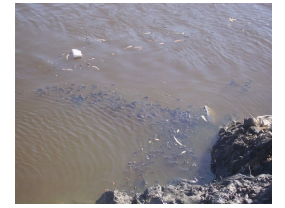
Figure 6: Thousands of dead and dying fish along Mariotteya stream.