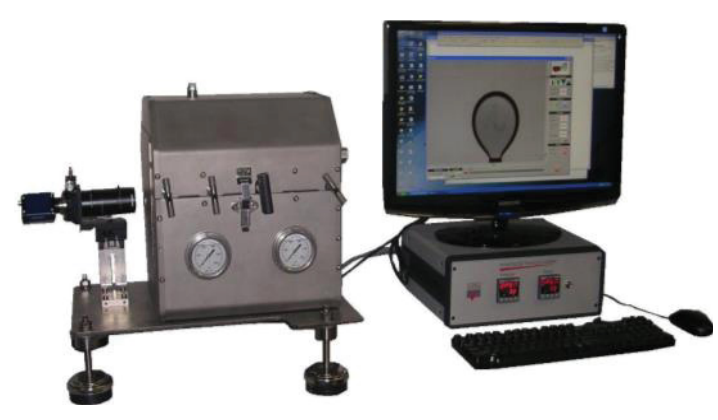
Figure 1: IFT-700 Apparatus.

The experiment was done using Brine salinity of 10,000 ppm and ambient pressure at 40 degrees Celsius and 60 degrees Celsius. At elevated temperature there is a significant reduction in IFT due to