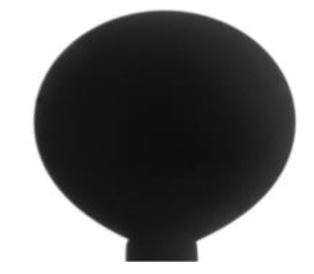
Figure 2: Rising oil drop.

Table 3: IFT at different Arginine concentrations and temperatures.