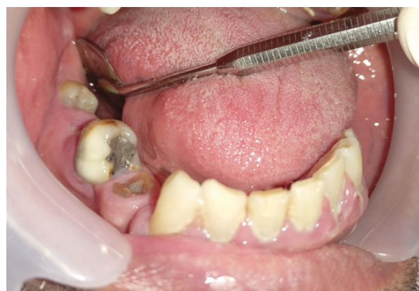
Figure 1: Pathologic tooth migration with an unusual position.

molar was detected (Figure 1). The patient had a panoramic radiograph which has been taken about two years ago. There were periapical lesions and periodontal pockets in both arches. The migrated tooth found to be avulsed from its normal position in the bone and located horizontally on the adjacent edentulous alveolar ridge (Figure 2). We ordered a panoramic radiograph to evaluate the current status of the teeth. In the new panoramic view, severe distal root resorption was detected in the migrated tooth which did not exist in the previous radiograph (Figure 3). This type of pathologic tooth migration has not been reported up to now. After routine examinations, the patient was referred to the oral and maxillofacial surgeon, periodontist and prosthodontist for extraction of the migrated tooth and further treatments.