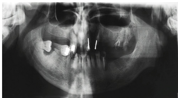
Figure 2: Pathologic tooth migration in a horizontal position, called avulsion.